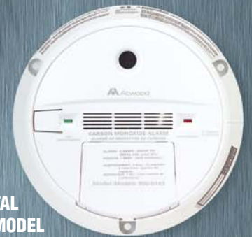
NON-DIGITAL DISPLAY MODEL

The Atwood CO Alarm uses three AA batteries. The easy opening cover gives fast access to the batteries.